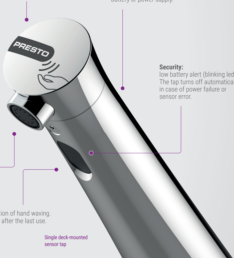
Single deck-mounted sensor tap

low battery alert (blinking led). The tap turns off automatically in case of power failure or sensor error.