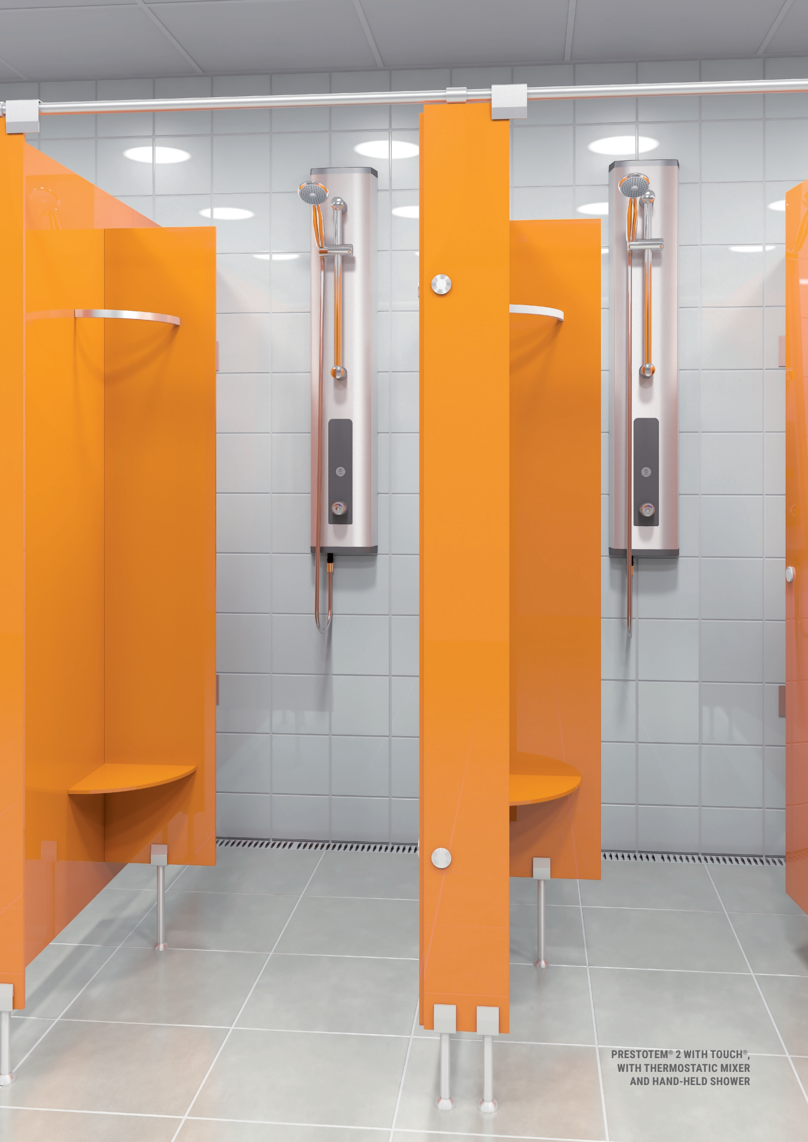
PRESTOTEM® 2 WITH TOUCH®, WITH THERMOSTATIC MIXER AND HAND-HELD SHOWER