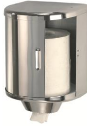
DT0303C Bright finish