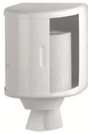
DT0303 White finish