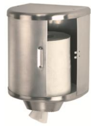
DT0303CS Satin finish