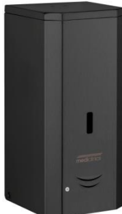
DJ0037AB Black epoxy finish