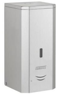
DJ0037ACS Satin finish