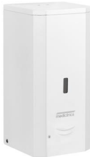
DJ0037A White epoxy finish