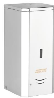
DJ0037AC Bright finish