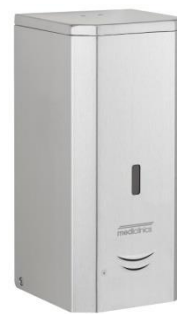
DJF0038ACS Satin finish