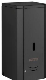
DJF0038AB Black epoxy finish