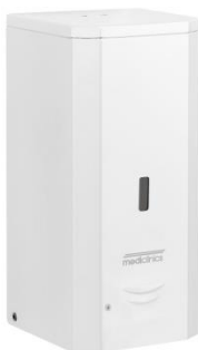
DJF0038A White epoxy finish