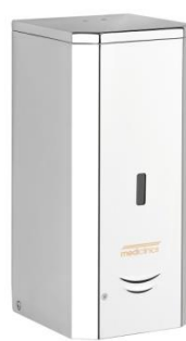
DJF0038AC Bright finish